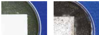
AirEase with Microban protection

You will enjoy cleaner air with Microban®-infused drain pans that inhibit the growth of mold and mildew. So you enjoy a healthier environment year after year.