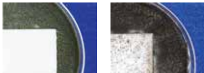
AirEase with Microban protection

You will enjoy cleaner air with Microban®-infused drain pans that inhibit the growth of mold and mildew. So you enjoy a healthier environment year after year.